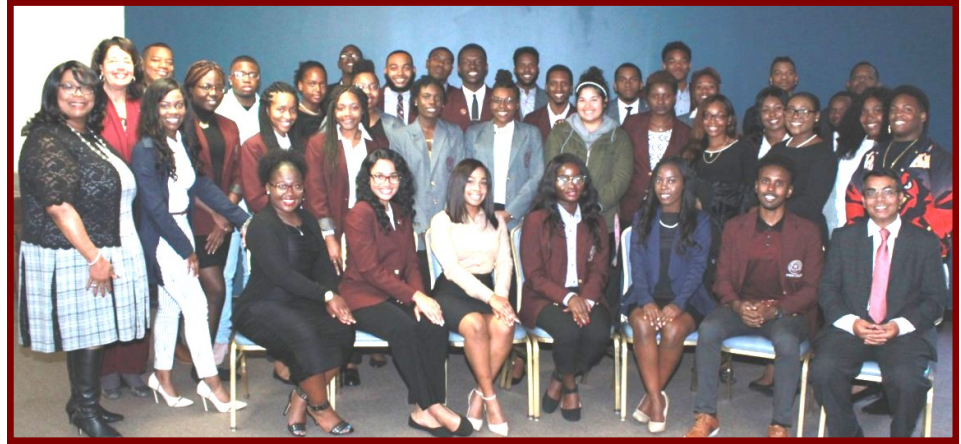
Thomas F. Freeman Honors Scholars and staff with Jarvis Christian College scholars and staff

Each semester up to 25 scholars sign up for the Research and Recruitment trip. From that number three scholars are selected to present research at a host university as that school sponsors a research symposium. On Thursday, October 18, 2018, scholars journeyed to Hawkins, Texas, to present research at Jarvis Christian College (JCC) . The symposium featured three scholars from the Honors College and four scholars from