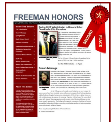
The Freeman Honors newsletter: Spring 2018 edition

We are very proud of Freeman Honors and what it stands for: Recognition of achievement in upholding the Honors College's core values of Honesty, Integrity, Community, Creativity and Excellence,