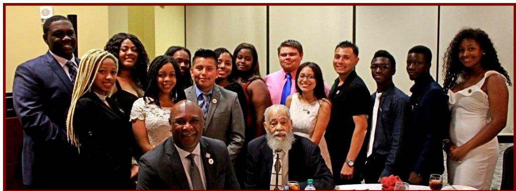
2018 Transfer and New-continuing Inductees

Junior scholars received Grey Honors College blazers as recognition of completing two years